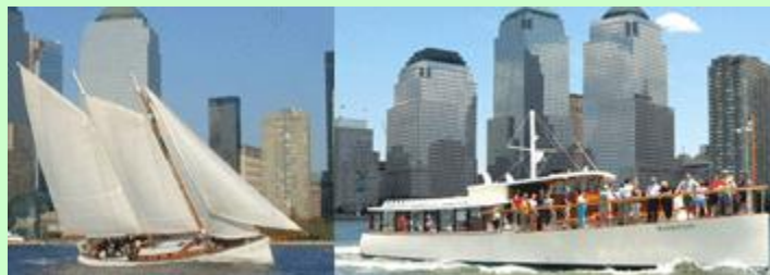
Schooner Adirondack OR Classic Yacht Manhattan

Annual Working Harbor Committee Gala Raffle