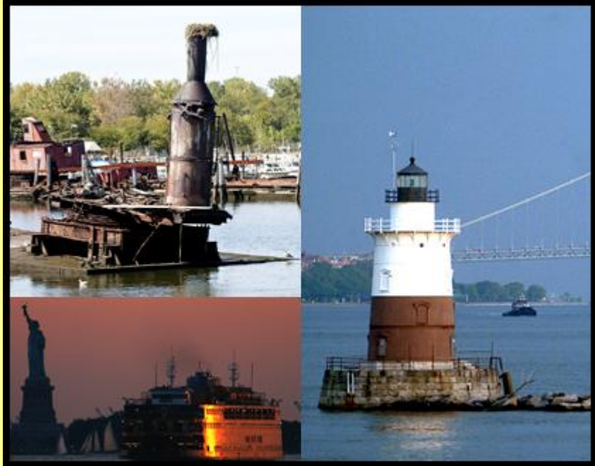
Top Left: Graveyard of Ships

Subway: 1 to South Ferry, R/W to Whitehall St. or 4/5 to Bowling Green Tickets: $60/$50 for