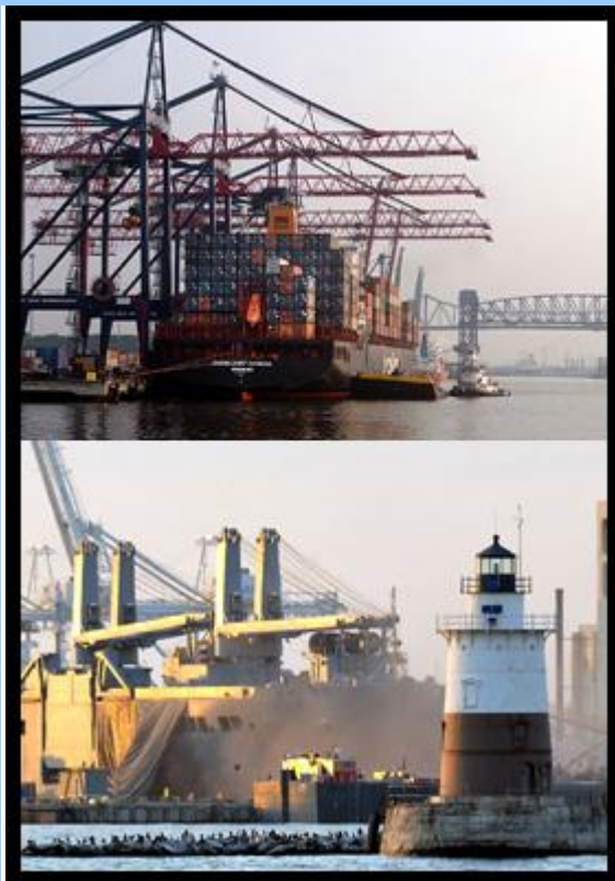
Top: New York Container Terminal in Arthur Kill, Staten Island (c) Bernie Ente Bottom: Lighthouse (c) Bernie Ente

Circumnavigation of Staten Island and Lighthouses Sunday, 16 October 10:00 a.m. to 1:00 p.m. on board the NY Water Taxi Departs from The Battery Slip 6 (Water Taxi Stop in front of Castle Clinton)