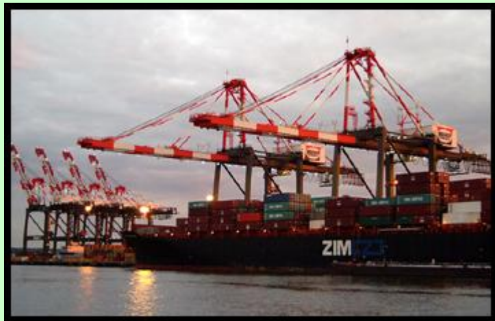
Maher Terminals