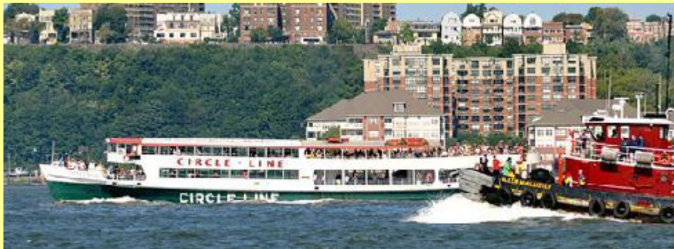
Tugboat Race with spectator boat 2009