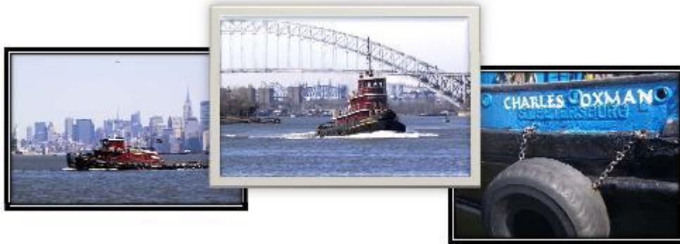
C - Tugboat with Bayonne Bridge - by Mitch Waxman L - Tugboat with City Skyline - by Mitch Waxman R - Tug Charles Oxman - by Jhoneen Preece-Doswell